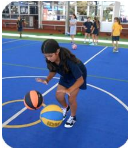
Desi managed to dribble two balls at the same time

We have been investigating how myelin grows in the brain cells to create learning pathways. Brett's drills that can be practised over and over were a great example of our discussions in class and we thank him for treating our students to this great experience.